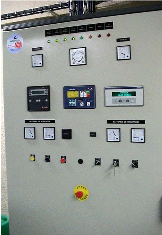
Switchboard with (unnecessary) meters