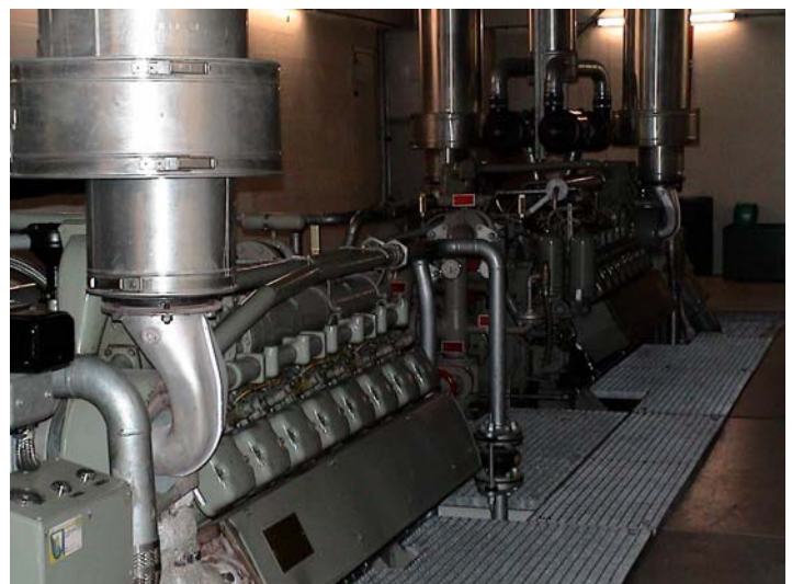
Deutz engine, 30 years old, for back up power in Military environment