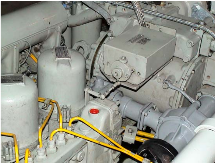
Electromechanical speed governor on Deutz engine